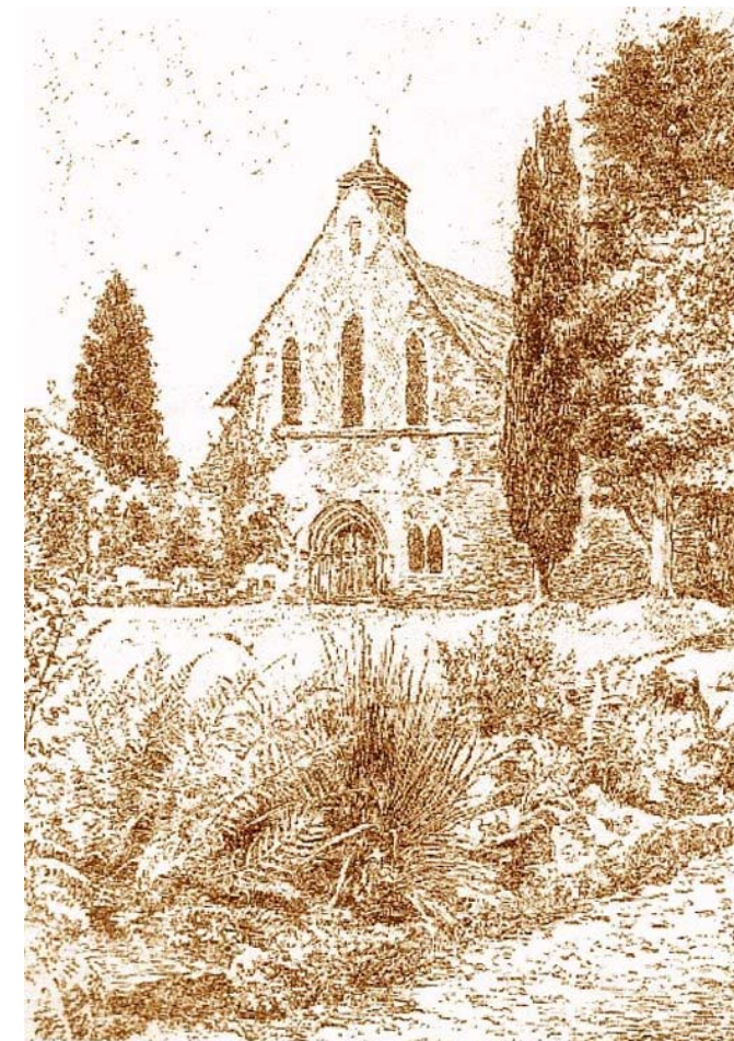
Beaulieu Abbey Refectory Now the Parish Church

Some of the privileges anciently granted to the manor of Beaulieu are still preserved. According to Gilpin, "no debtor can be arrested within its precincts, unless the lord's leave be obtained. The lords of Beaulieu also enjoy the liberty of the cinque ports. They hunt also and destroy royal deer if they stray within the purlieu of the abbey." He continues, "on the day we were at Beaulieu, we found the hedges everywhere beset with armed men. It appeared as if some invasion were expected. On inquiring we were informed that a stag had been seen that morning in the manor and all the village was in arms to prevent his escape back into the forest. The fortunate man who shot him had a gratuity from the lord."